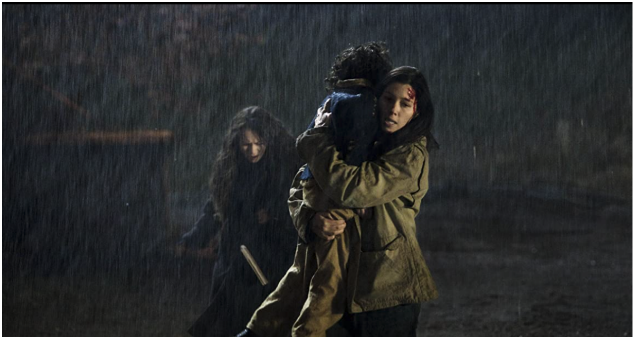
Jessica Biel in The Tall Man (2012)