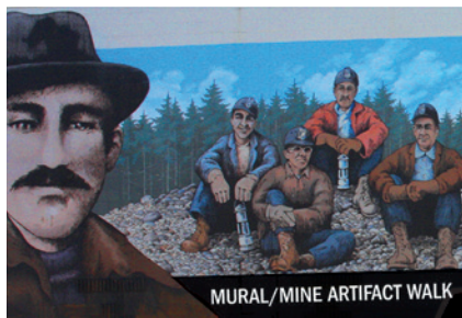
MURAL/MINE ARTIFACT WALK

Sept 16-17 Six in the Stix Biking Festival