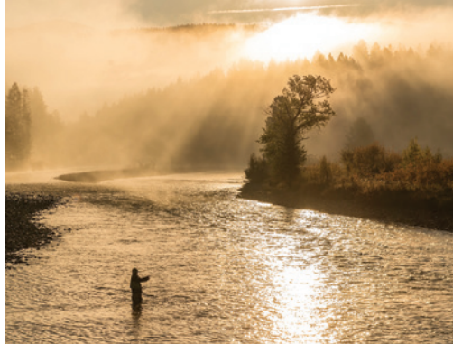
FLY FISHING ON THE BULL RIVER