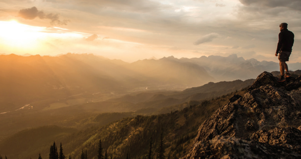
MORRISSY RIDGE NEAR FERNIE

Just south of town, Rocky Mountain Riders (1-877-950-7533) rents ATVs for trail riding. Just east of town, Kicking Horse River rapids from mild to wild are popular for rafting. The Upper and Middle Canyons are whitewater favourites, while heli-rafting is offered on the Lower Canyon. Experience the adventure with one of Golden's river guides (tourismgolden.com/rafting). Guided stand-up paddleboard and inflatable kayak tours are also available.