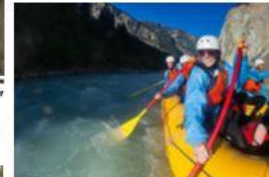
Whitewater rafting fans can head out on rapids of varying levels of difficulty on the Kicking Horse River.