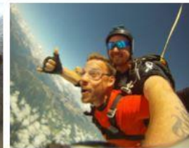
Skyline Extreme Yeti offers daredevil tandem alpinism over Golden, B.C.

open to climbers ages 12 and up. Details: kickinghorsemountain.com Connoisseurs With Whiskers: At the Northern Lights Wolf Centre, about 10 kilometres north of downtown Golden, you can visit the resident wolves that Shelly and Casey Black hand-raise from pups after the small zone or breeding facilities where they were born had to find them new homes. You can also join some of the wolves — all of which are accustomed to being around people — as a guided photography walk in the wilderness. Details: northernlightswolfcentre.com