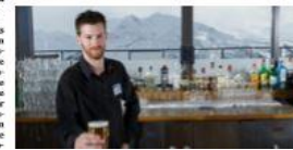
who will point out nesting birds and wildlife while you sit back and soak in the scenery. Details: whitewaterhikes.com Rat and details: Two restaurants that earn well-deserved plags from locals are Whitetown Mountain House in Golden's quiet town center and Elbow52 just south of downtown. Right by Restaurant, at the top of the gondola at Kicking Horse Mountain Resort, has spectacular views to go along with its exceptional comfort-food menu. From June to September, check out the farmers' markets that local growers will