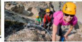
Climbers make their way on the via ferrata, a hiking and climbing course secured by cables at Kicking Horse Mountain Resort in Golden, B.C.