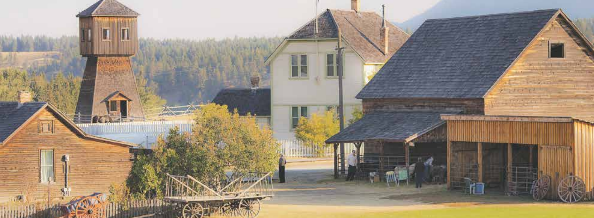
Fort Steele Heritage Town