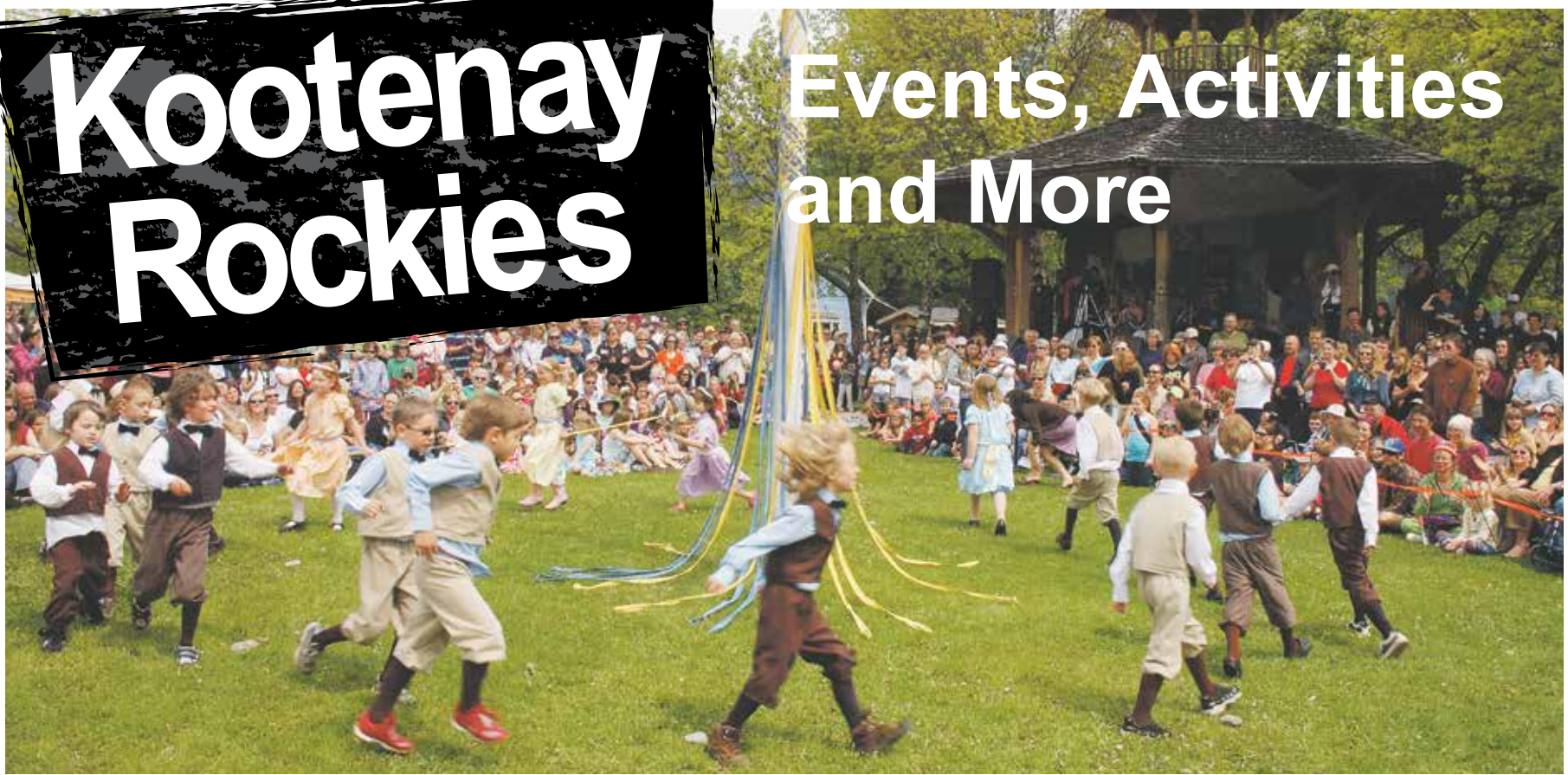
Celebrating at Kaslo May Days