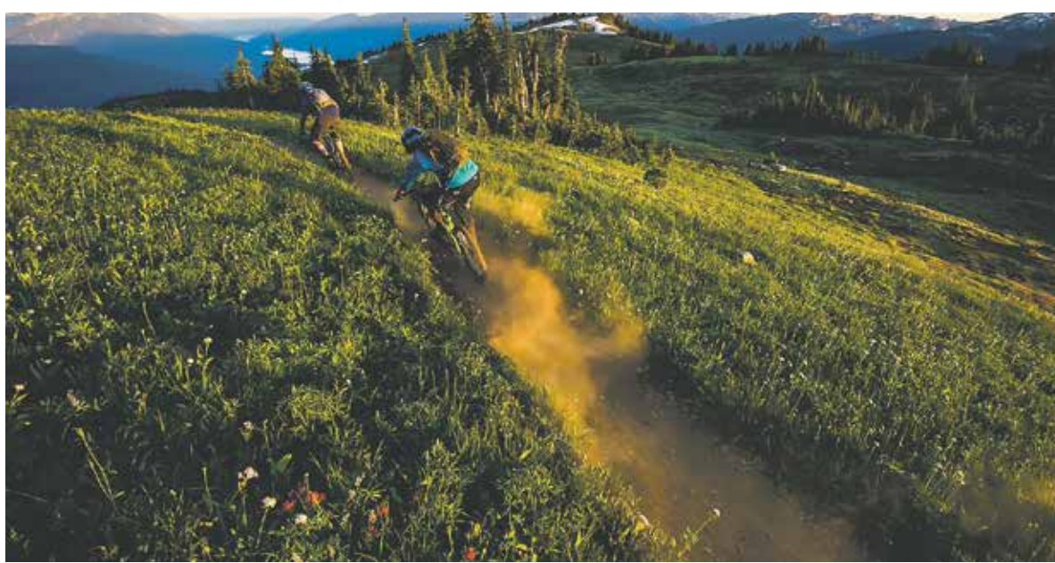
Revelstoke Bike Fest