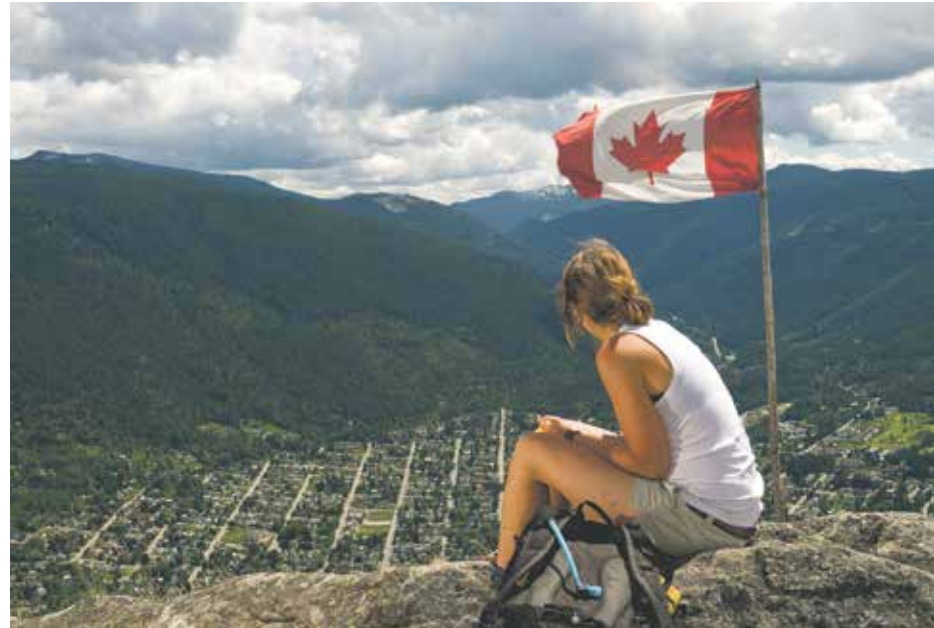
Pulpit Rock Look-out above Nelson, BC

You can also catch other wildlife viewing opportunities near Golden, such as renowned bird watching along the Columbia Wetlands, or a scheduled walk with a pack of gray wolves at the Northern Lights Wildlife Centre. Learn more at KickingHorseResort.com .