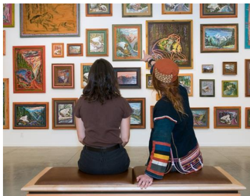
Historic Downtown Nelson & Touchstones Nelson: Museum of Art and History