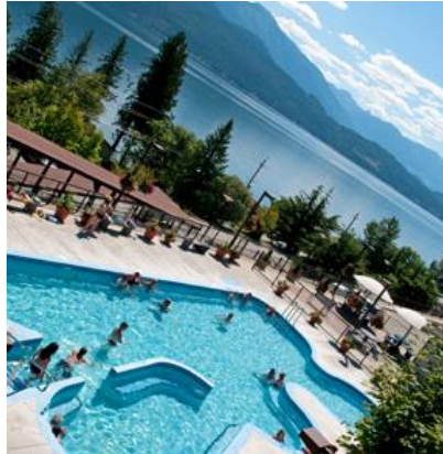
Ainsworth Hot Springs