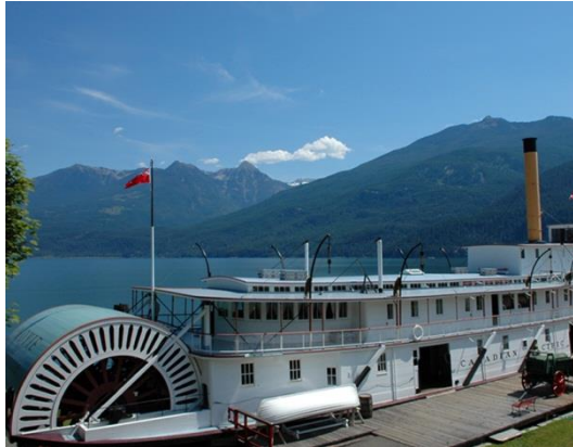
Kaslo's SS Moyie