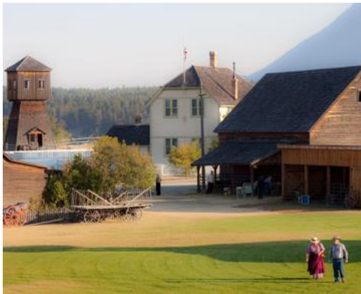
Fort Steele Heritage Town