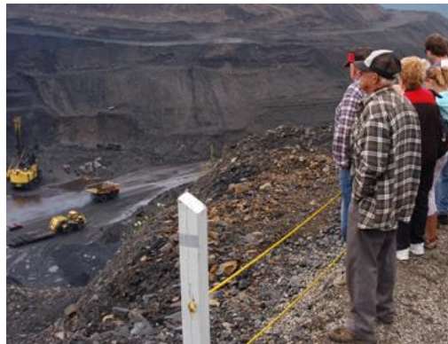
Free & Educational Mine Tours