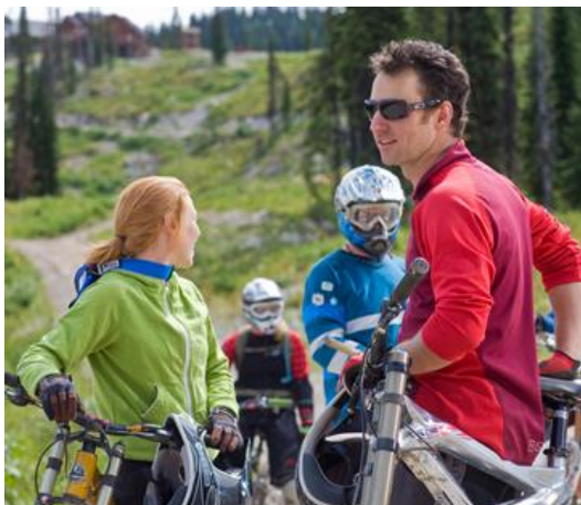
Fernie Alpine Resort