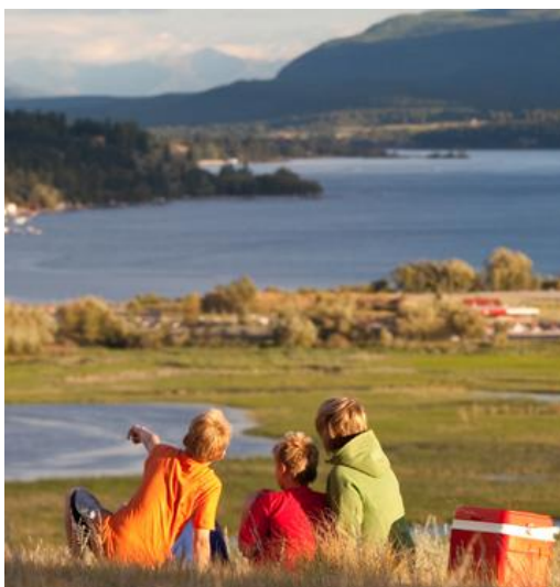
Lake Windermere & the Columbia Valley