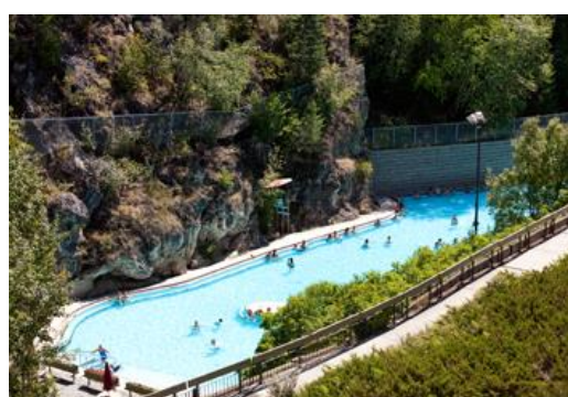
Radium Hot Springs pools