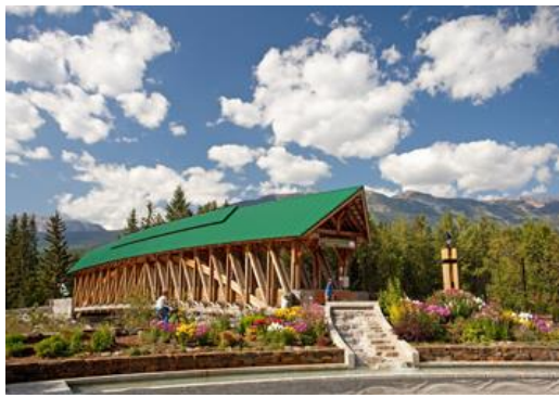
Kicking Horse Pedestrian Bridge