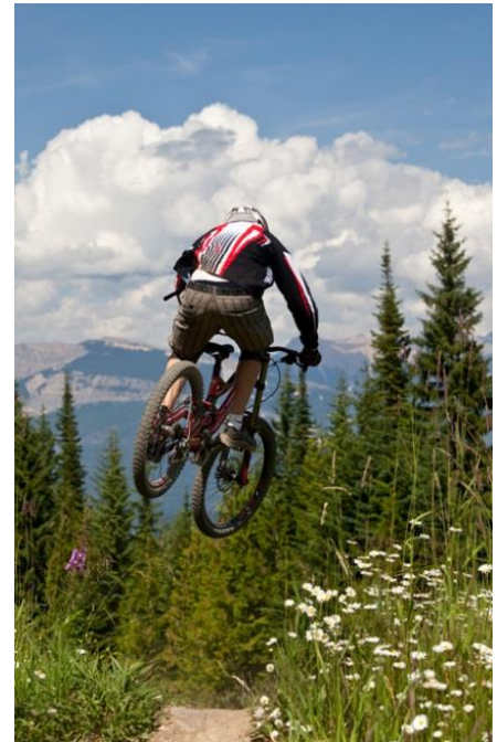
Touring, Rail Trails and Lift-served Mountain Bike Resorts.

Continue your travels north on Highway #93 through Kootenay National Park; there are several points of interest and short hikes from the highway. A few include, Kootenay Valley Viewpoint, Vermilion Crossing, the Paint Pots, Stanley Glacier hike and the Fireweed Trail at the Continental Divide. Continue on Highway #93 through Vermilion Pass, into Alberta and back to Banff National Park and the TransCanada Highway #1.