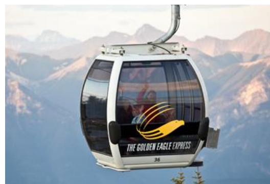
Kicking Horse Mountain Resort