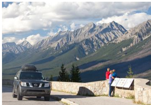
Kootenay National Park