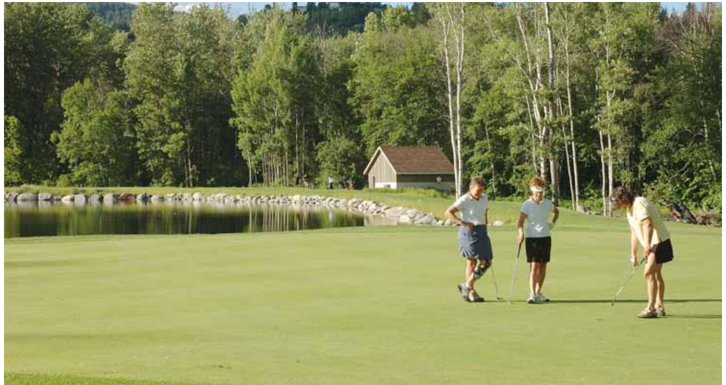
The Redstone Golf Resort in Rossland, B.C.

Certainly, a golfer could easily spend an entire vacation along the Kootenay Golf Trail, but there is so much more to explore through-