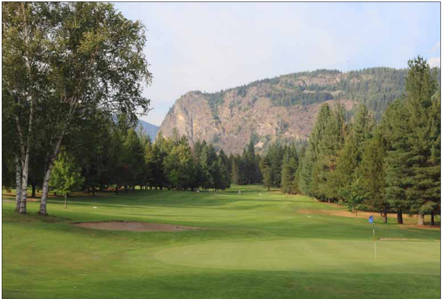
Castlegar Golf Club.