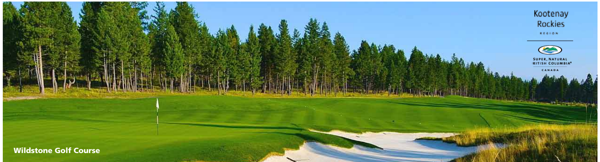
Wildstone Golf Course