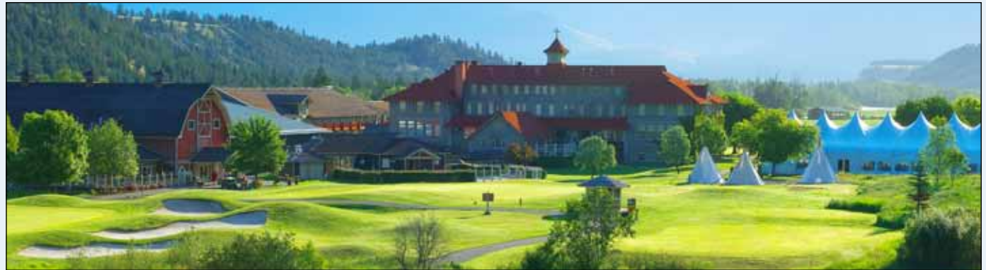
St. Eugene Golf Resort & Casino in Cranbrook, B.C.

With 45 holes of golf — all nestled between the Purcell and Rocky Mountain ranges — the facility includes two championship courses (Riverside and Mountainside) and the par-3 Creekside course. The spectacular Riverside course offers beautiful emerald greens. The Mountainside course, which was revitalized by famed designer Doug Carrick in 2012, features velvety fairways and a host of riveting holes that will test every club in your bag.