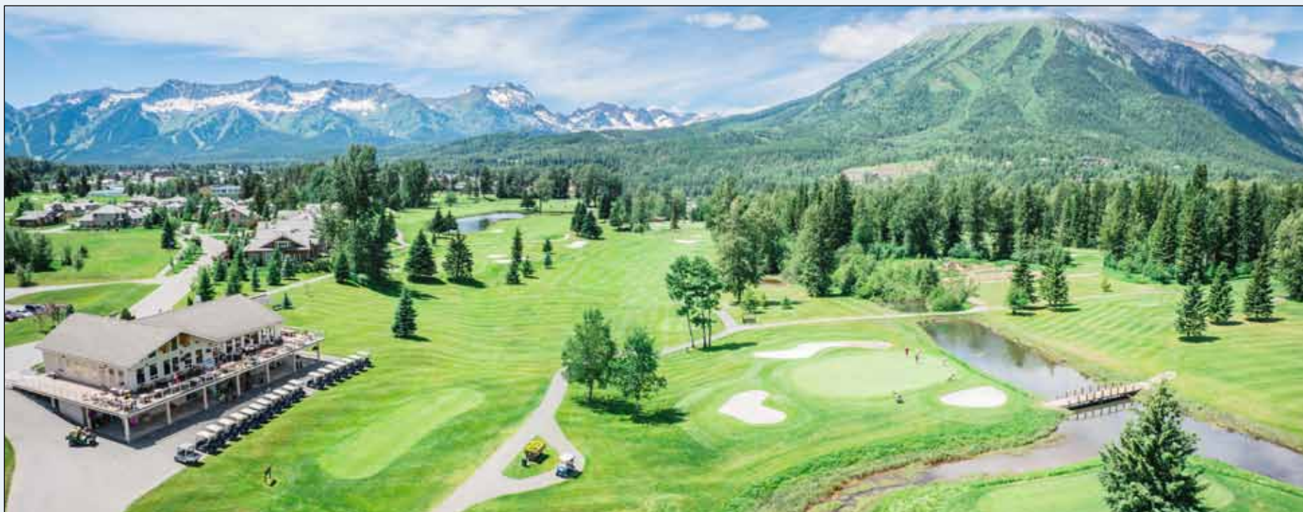
Fernie Golf &amp; Country Club, sixth hole.