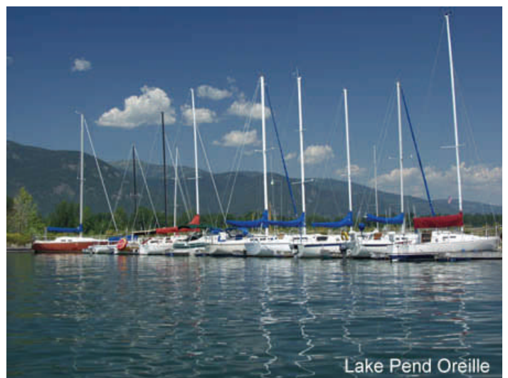
Lake Pend Oreille