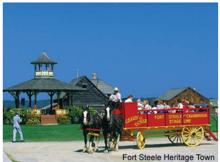
Fort Steele Heritage Town