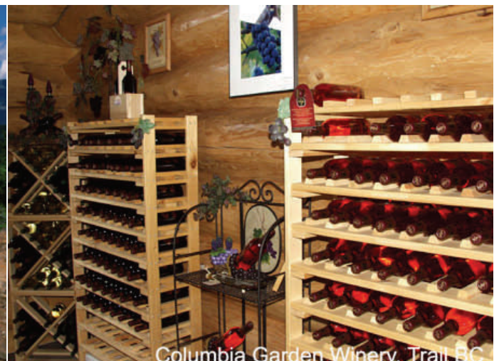
Columbia Garden Winery, Trail BC