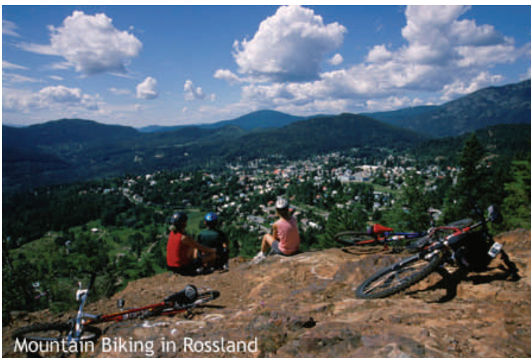
Mountain Biking in Rosland

This panoramic tour connect the Kootenay Rockies and the Thompson Okanagan regions. The loop is rich in heritage sites, cultural events and outdoor adventure opportunities. Calgary Alberta, Vancouver British Columbia and Spokane Washington are the international gateways for this circle route and the regional airports include Castlegar, Cranbrook, Trail and Kelowna.