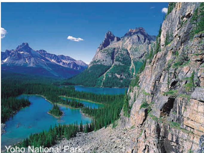
Yoho National Park

This popular cycle and vehicle tour visits three magnificent national parks and features attractions in Golden and Radium Hot Springs. There is even a special event named after this tour - it takes place each May holiday weekend where over a hundred cyclists gather to enjoy the Golden Triangle.