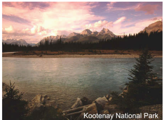
Kootenay National Park